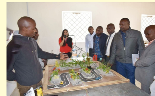
BUILDING AWARD WINNING PROJECT