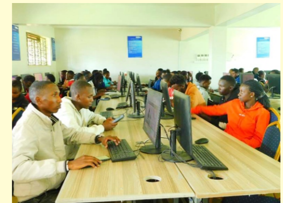
JITUME ICT HUB